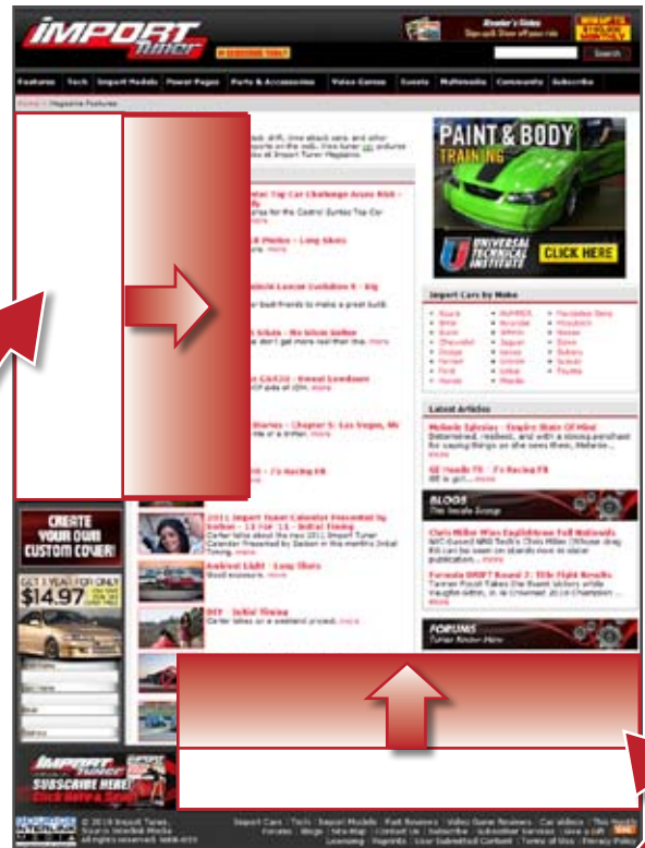
160x600 ad unit expands to max size 320x600 to the right on click